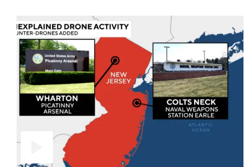
U.S. drone sightings: What were lawmakers told at classified briefing?