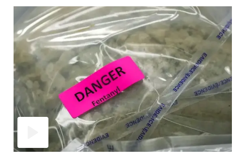
Over a pound of fentanyl seized at U.S. border allegedly came from Canada