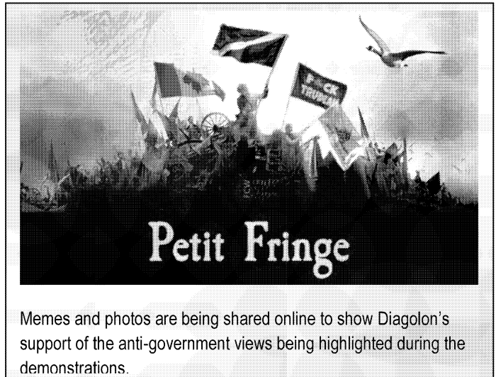
Memes and photos are being shared online to show Diagonon’s support of the anti-government views being highlighted during the demonstrations.