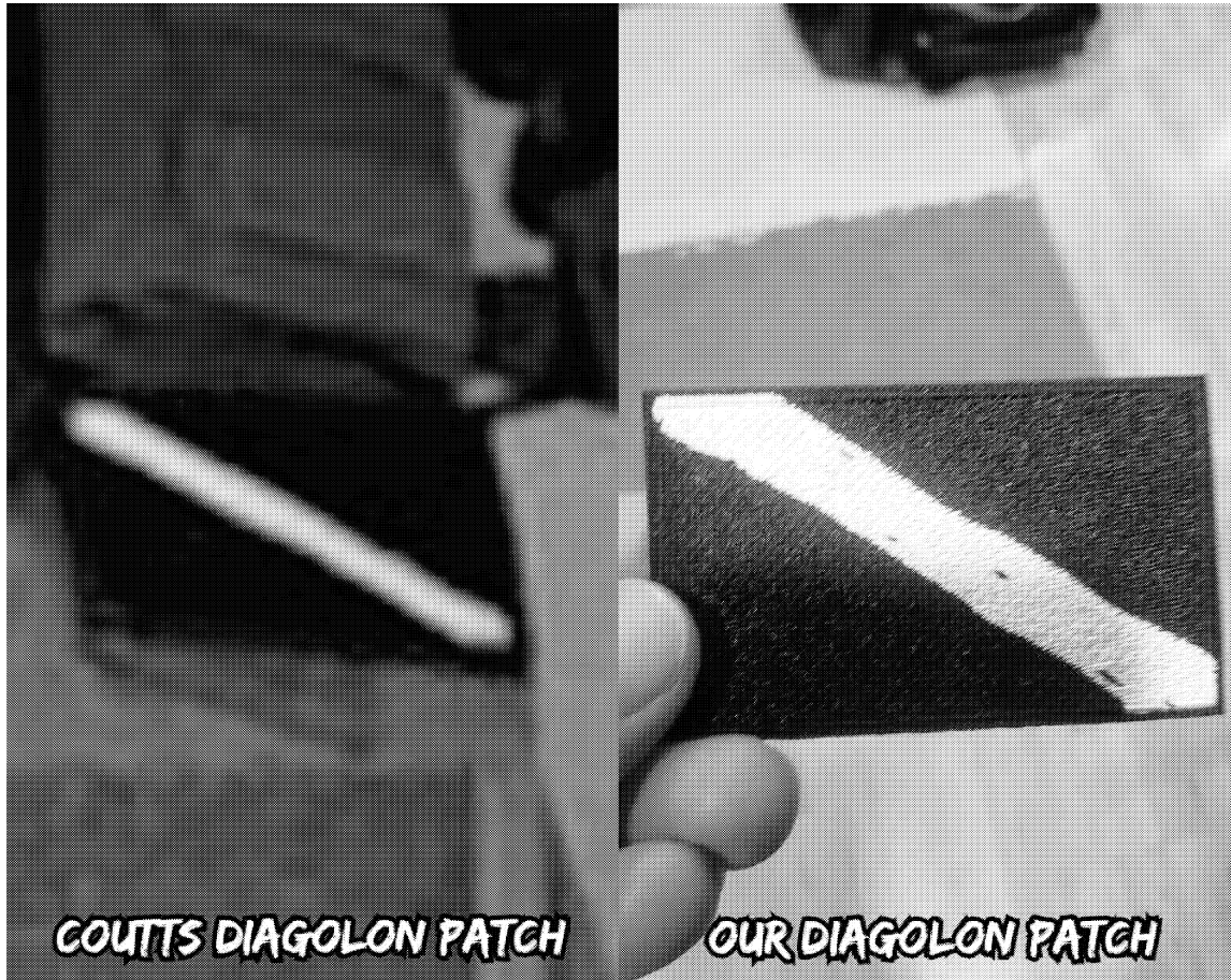
Image 7 : Image posted to Jeremy MacKenzie’s podcast comparing the “official” Diagolon patch to the patch found in Coutts