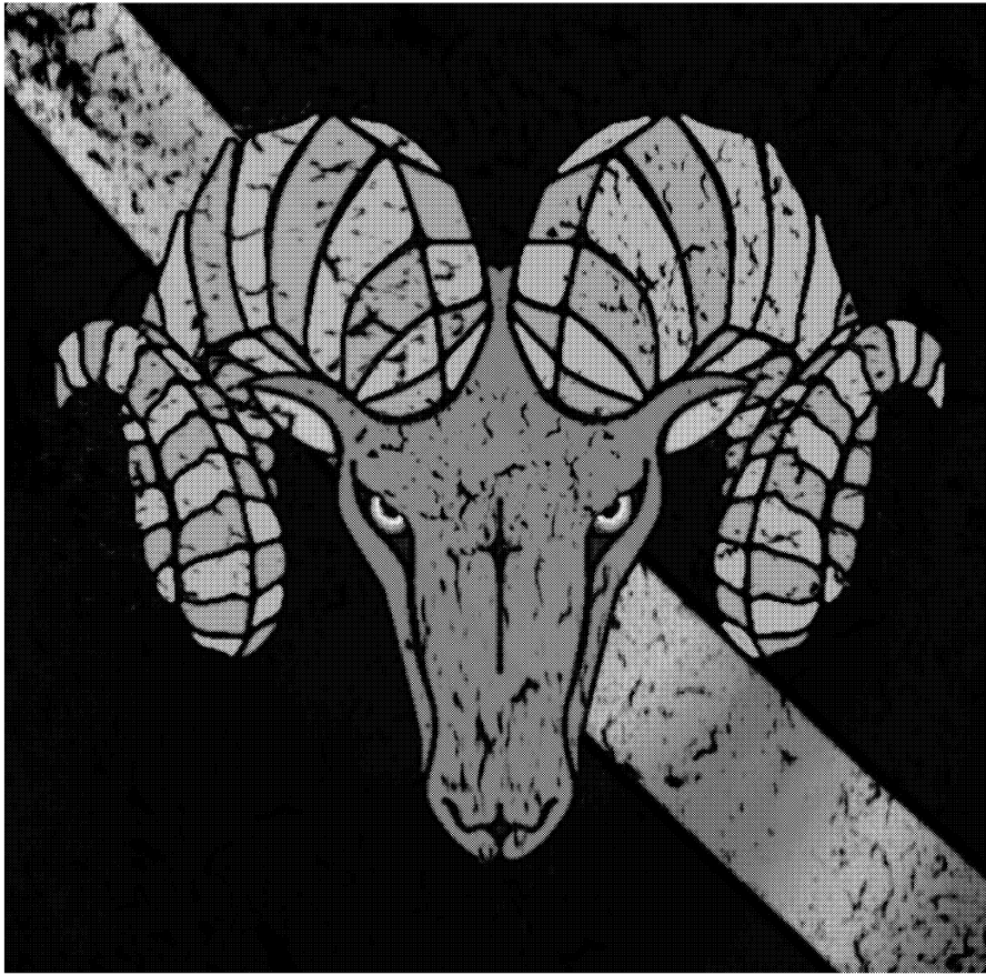
Above: "Black Philip" cartoon often used in DIAGOLON memes.