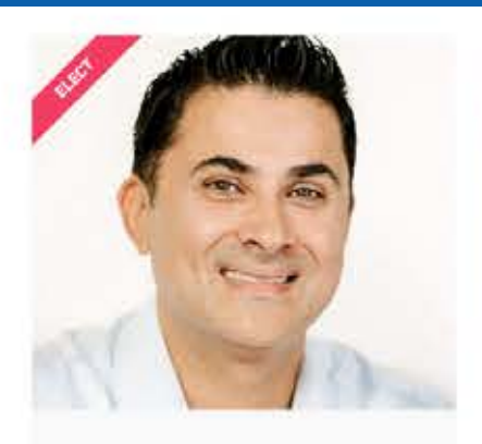
Jet Sunner Delta North