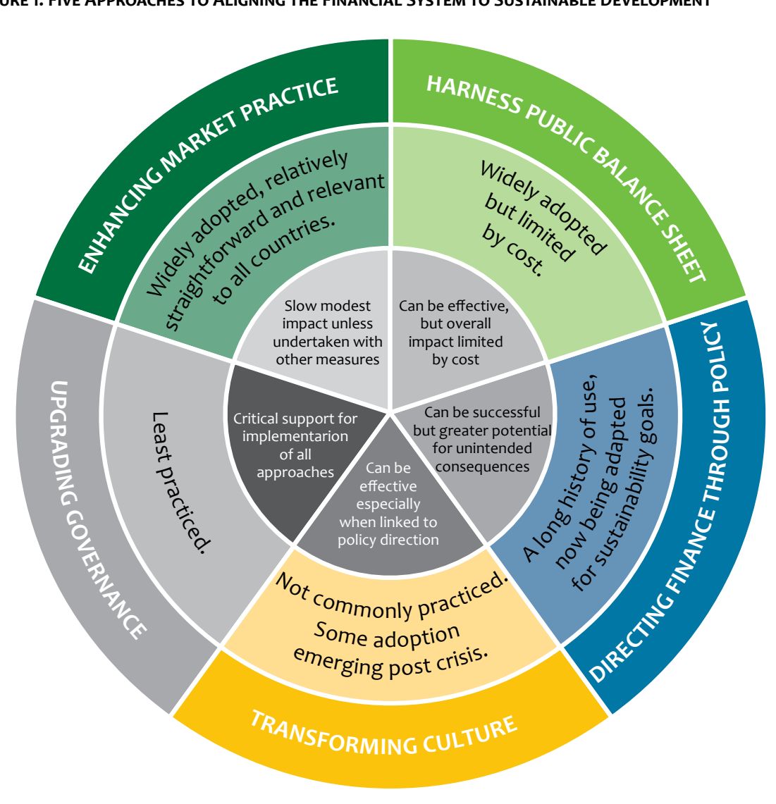
FIGURE 1: FIVE APPROACHES TO ALIGNING THE FINANCIAL SYSTEM TO SUSTAINABLE DEVELOPMENT

The UNEP Inquiry into the Design of a Sustainable Financial System was established in early 2014 to explore these developments and how to align the financial system with sustainable development. It published its report at the end of 2015, The Financial System We Need , based on thematic and country studies. It consolidated emerging measures from developed and developing countries into a toolbox of five approaches.<sup>10</sup>