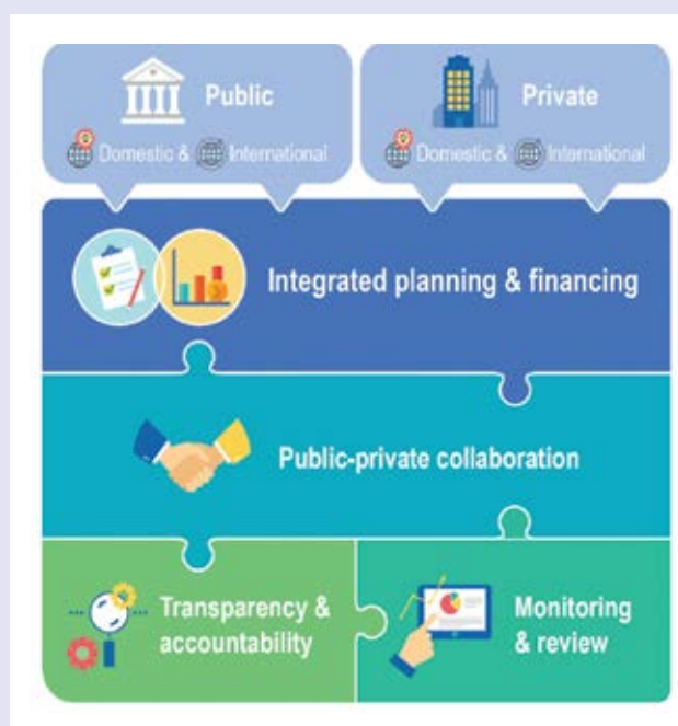
Figure 4 Dimensions of the DFA analytical framework

a For more on DFAs, including a more in-depth overview of the kind of questions that can be covered by a diagnostic assessment of financing trends, challenges and opportunities, see the DFA guidebook, UNDP, 2019